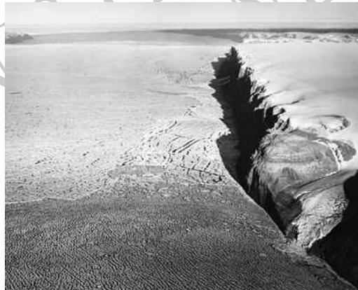
A crevasse in a glacier can be several feet wide and hundreds of feet long.