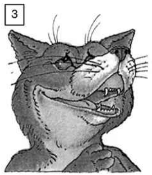
"Oh lovely crow!" he said. "Your eyes are so bright and your feathers are so lovely"