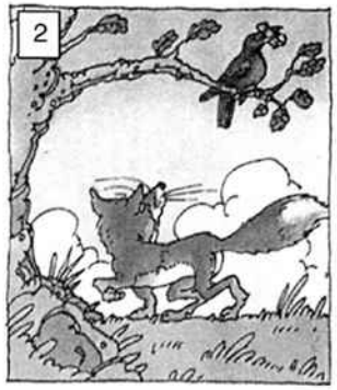
It was a fox. He saw the cheese and wanted it for himself. He smiled at the crow.