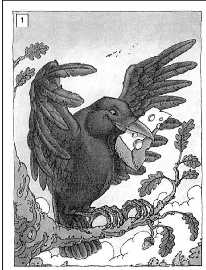
Once an old crow stole a lump of cheese. He carried it away to the nearest tree.