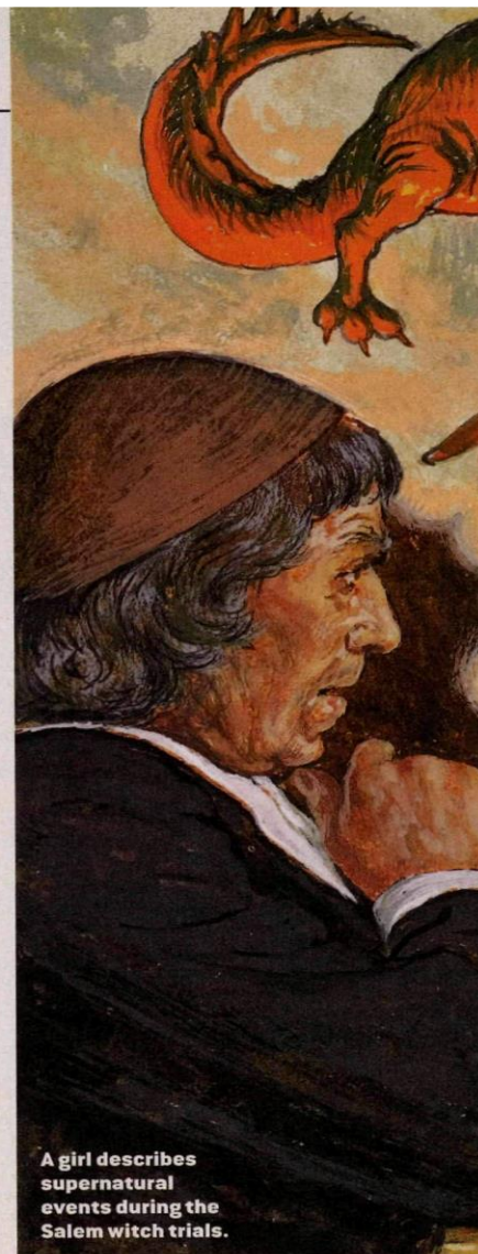
A girl describes supernatural events during the Salem witch trials.

Reverend Samuel Parris: Thank you for coming, Doctor. We're very worried about Betty's cousin