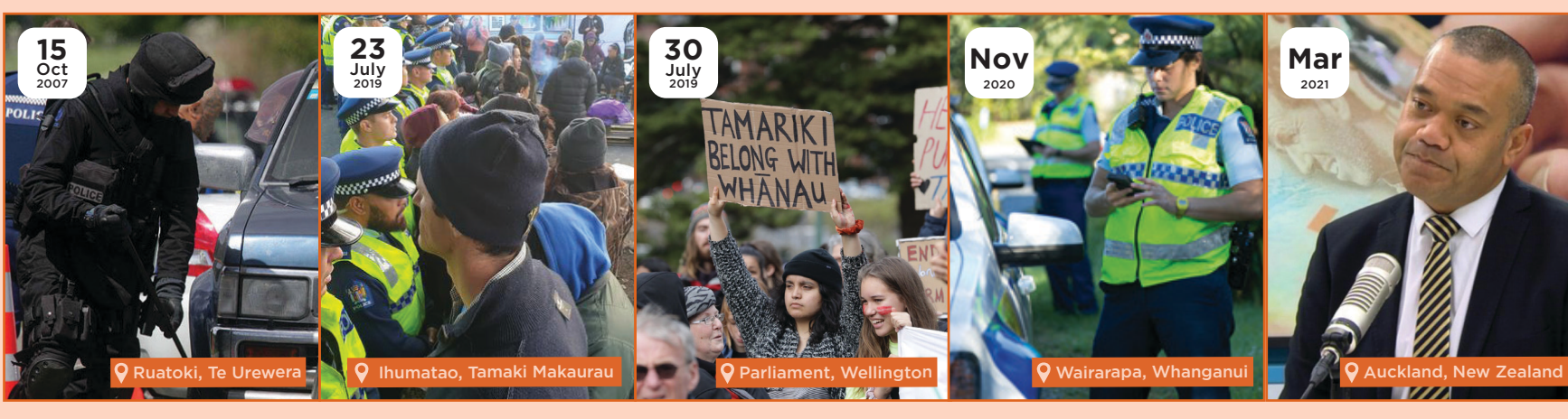
The Urewera Raids