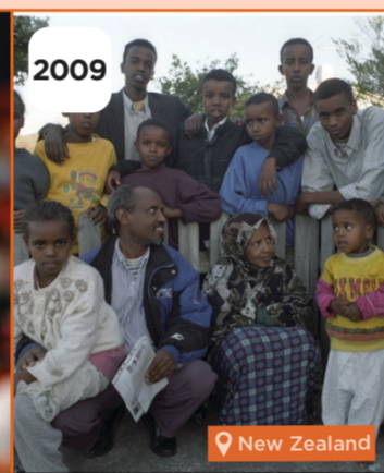
Family Link Policy imposed on African & Middle Eastern Refugees