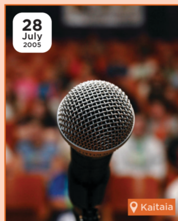
The End of Tolerance Speech is delivered to a Grey Power Group