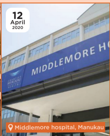
Filipino nurse wearing mask abused by patient for "bringing COVID to NZ"