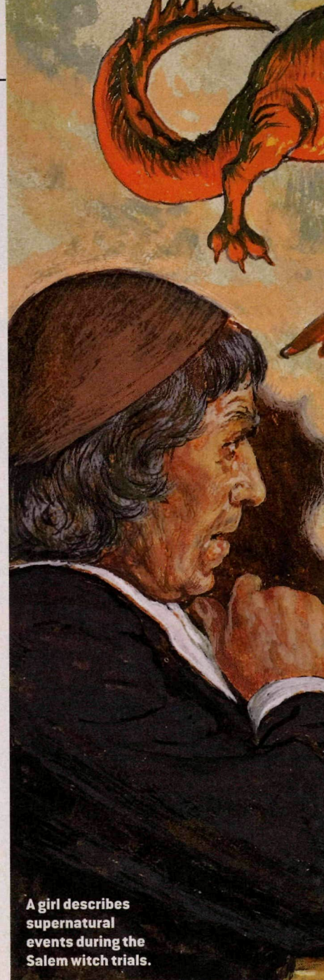
A girl describes supernatural events during the Salem witch trials.

Reverend Samuel Parris: Thank you for coming, Doctor. We're very worried about Betty's cousin