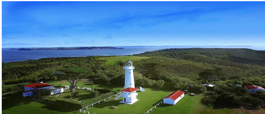
The Tiritiri Island Lighthouse that we will be visiting

Week 1 – The Week of July 26 to August 1, 2021