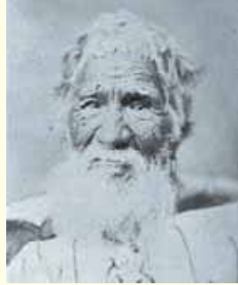
Eruera Maihi Patuone, one of the chiefs who signed the 1831 petition.